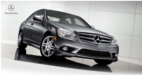
Enhance your C-Class experience here.

PRICES SUBJECT TO CHANGE WITHOUT NOTICE PRICES DO NOT INCLUDE TAXES OR SHOP CHARGES